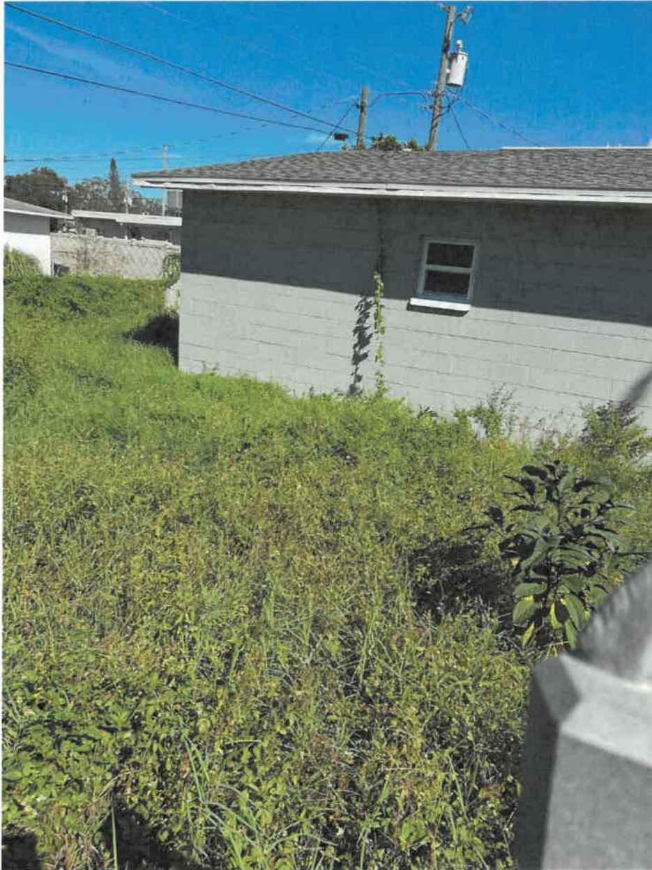
North-west face backyard weeds (9/10/2025)

jcrisp@kennethcityfl.org | www.kennethcityfl.org