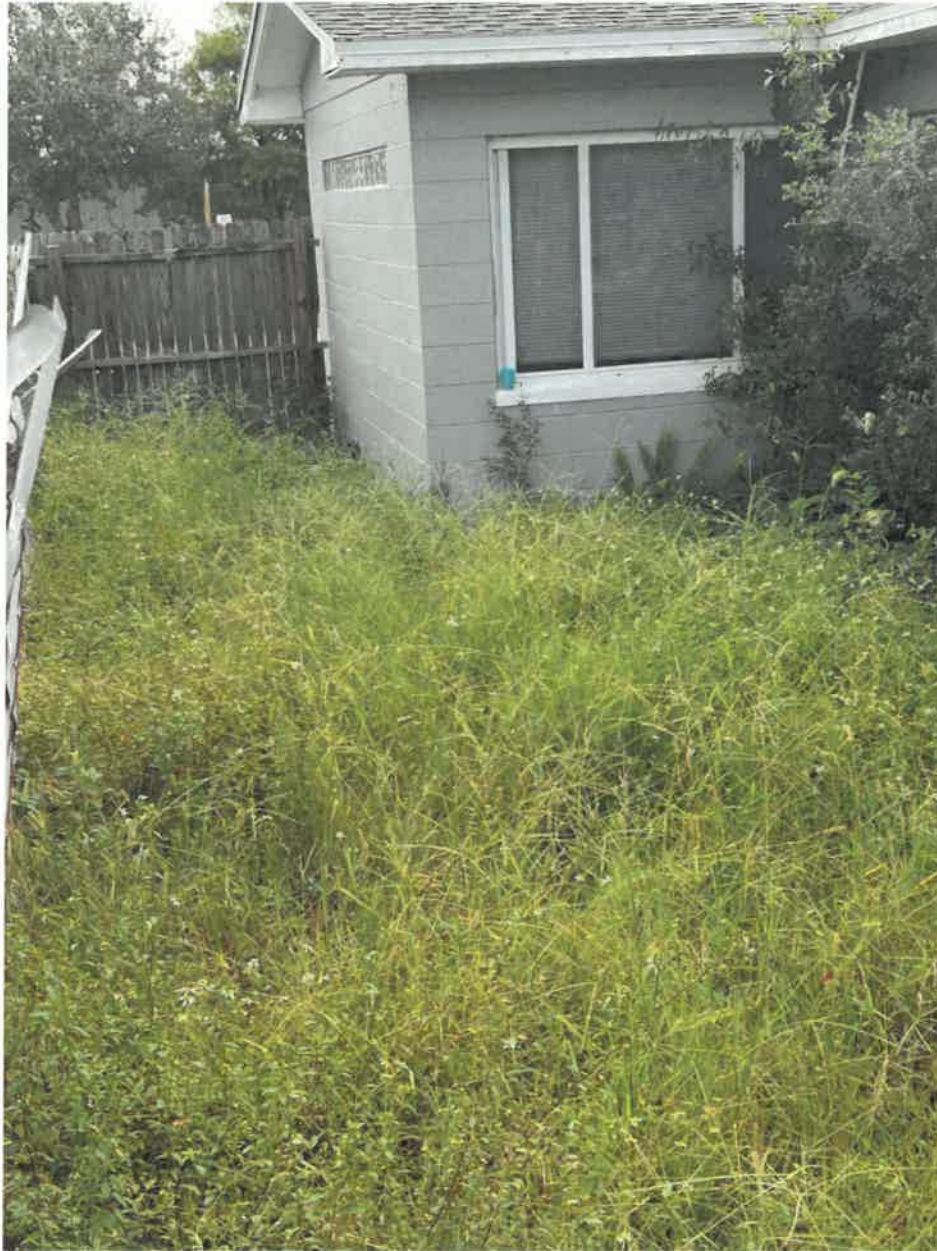
East face backyard weeds and falling fence (9/10/2025)

jcrisp@kennethcityfl.org | www.kennethcityfl.org