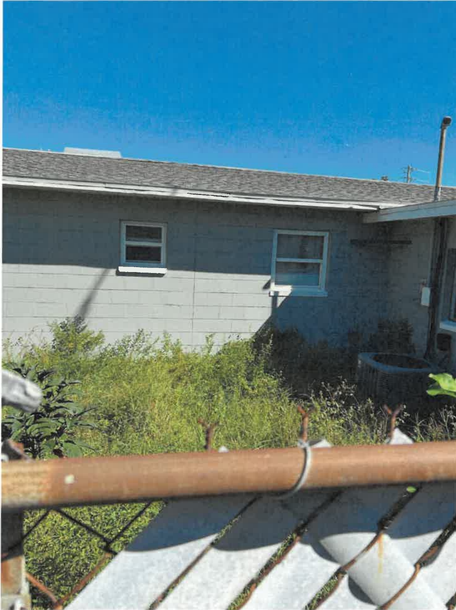
North face backyard weeds (9/10/2025)

jcrisp@kennethcityfl.org | www.kennethcityfl.org