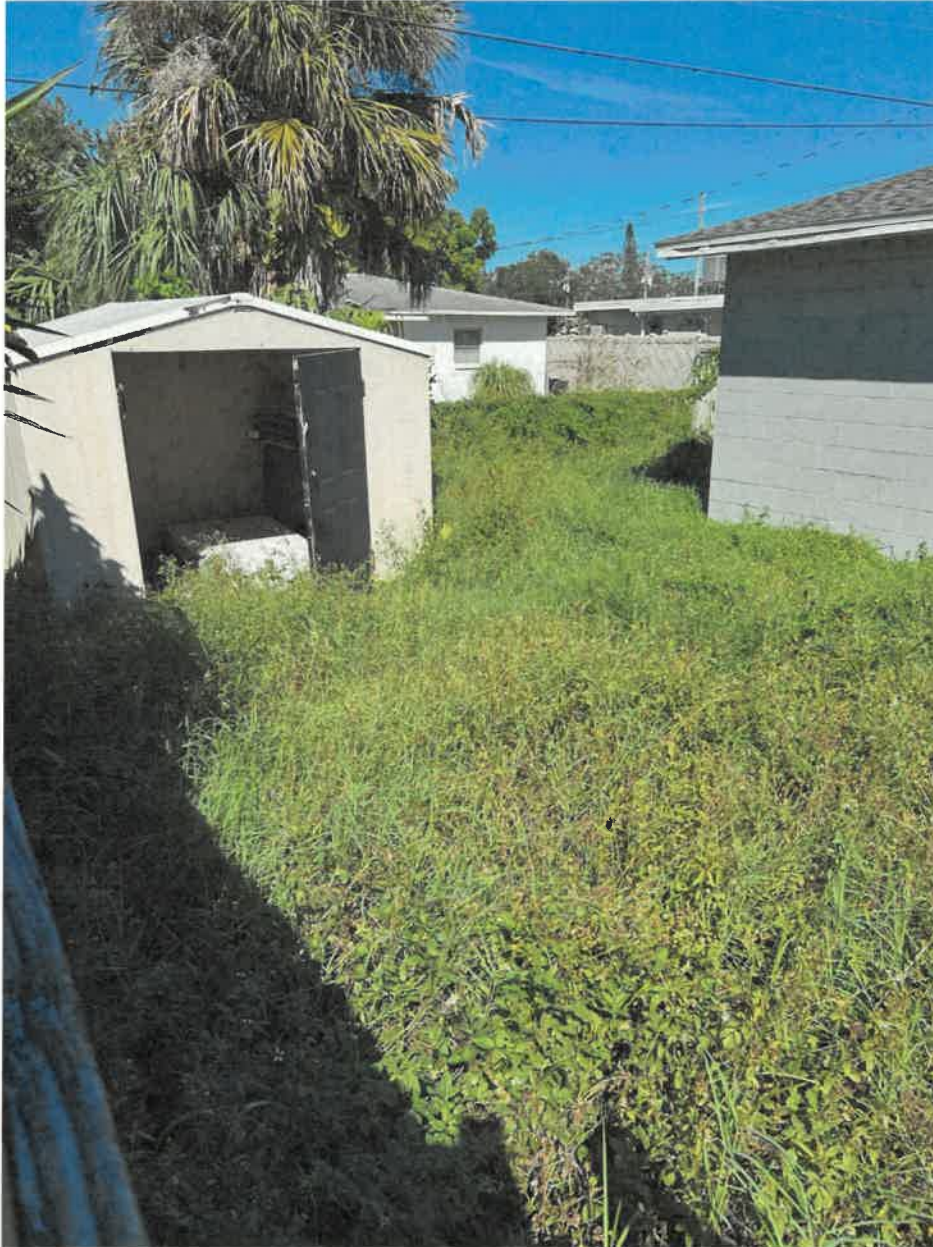
West face backyard weeds (9/10/2025)

jcrisp@kennethcityfl.org | www.kennethcityfl.org