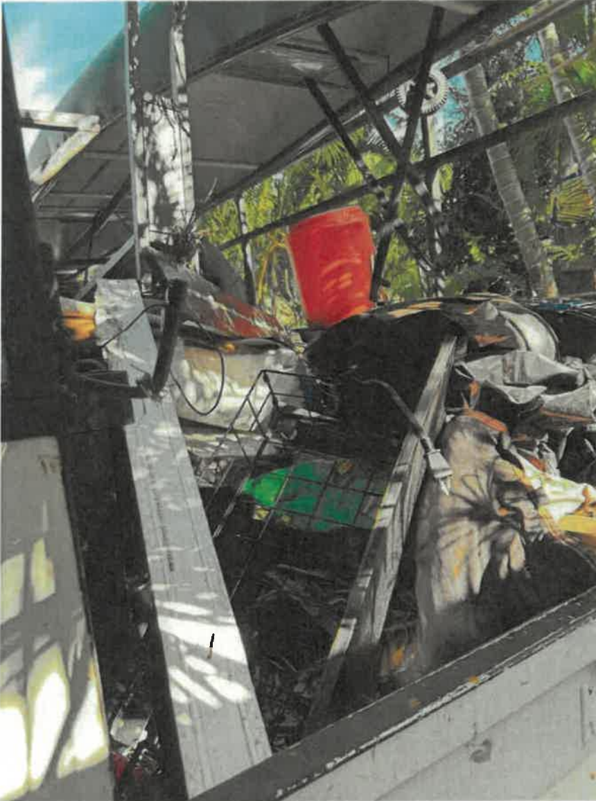
Picture 2: Castle residence driveway. Junk in the back of the white work truck 1/22/26

jcrisp@kennethcityfl.org | www.kennethcityfl.org