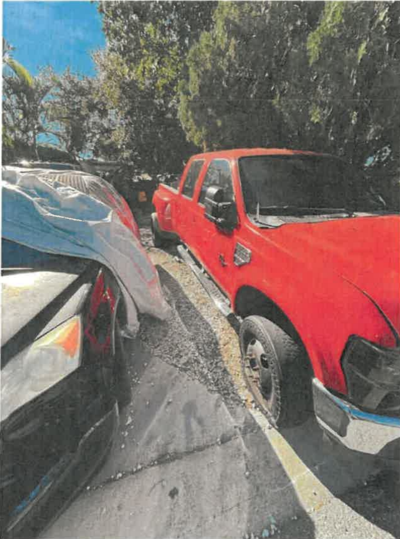
Picture 3: Castle residence driveway. Inoperative Red work truck 1/22/26

jcrisp@kennethcityfl.org | www.kennethcityfl.org