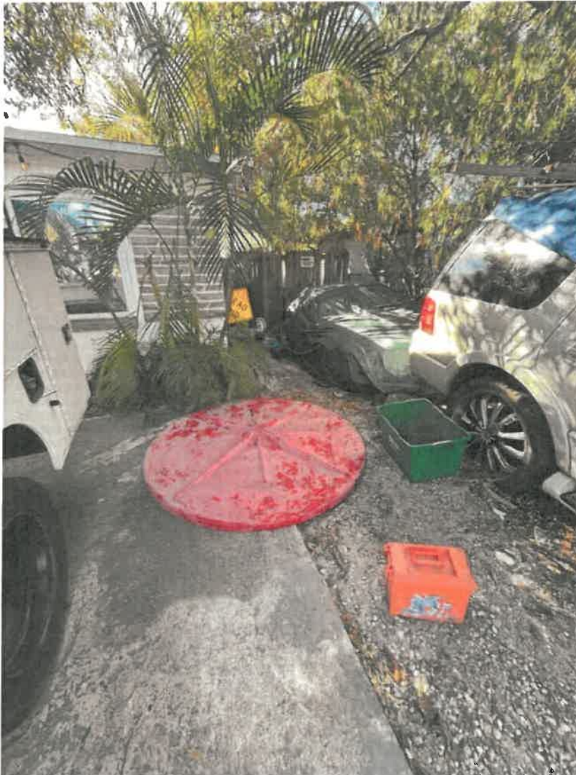
Picture 1: Inoperative vehicles at the front of the Castle residence. 1/22/26

jcrisp@kennethcityfl.org | www.kennethcityfl.org