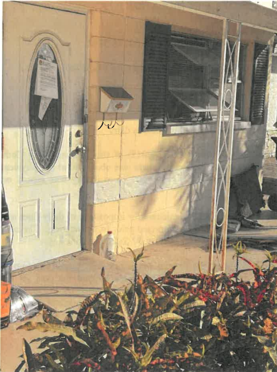
Picture 1: Front porch, auto radiator, carpet, trash. Picture taken on 1/20/2026.

jcrisp@kennethcityfl.org | www.kennethcityfl.org