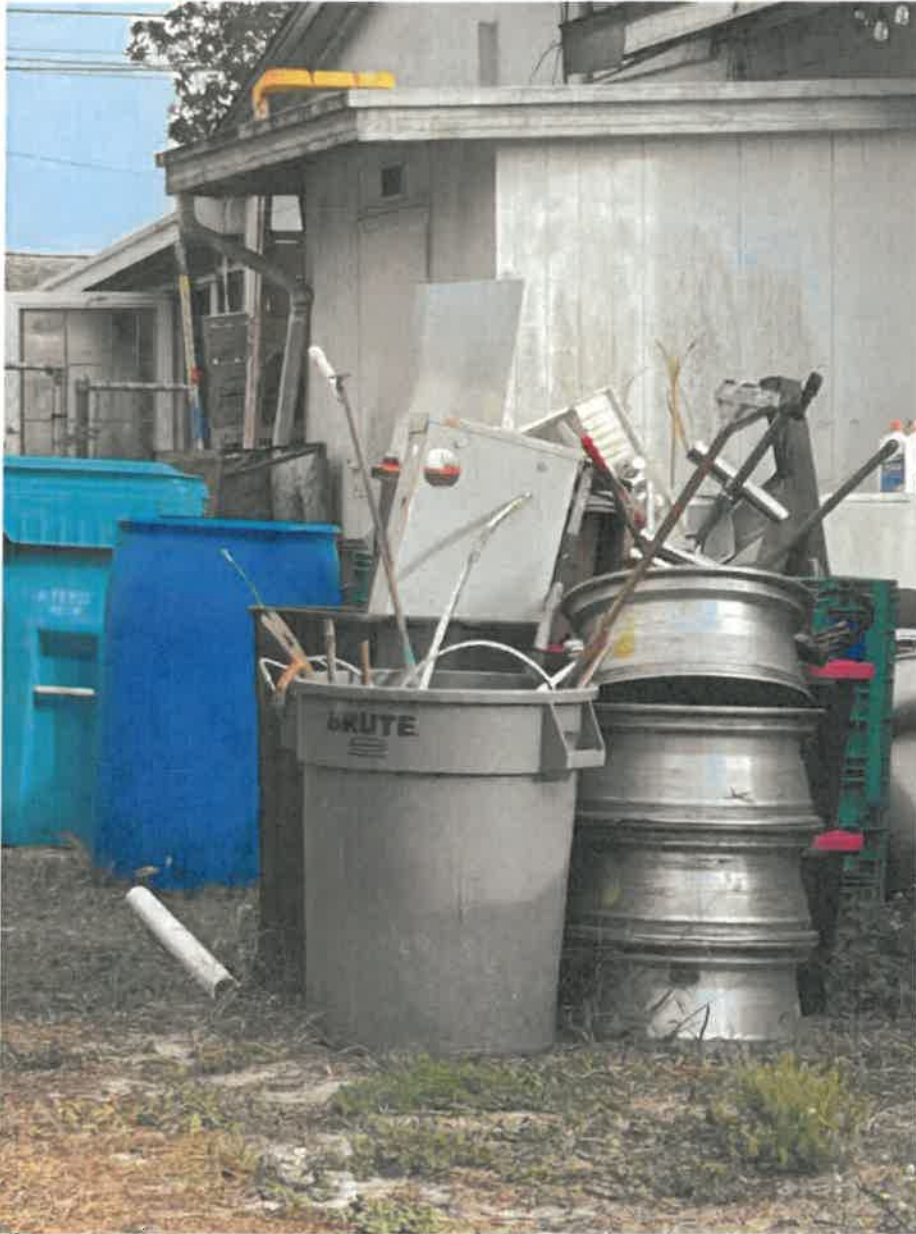
Photograph 3: Junk as of December 16, 2026

jcrisp@kennethcityfl.org | www.kennethcityfl.org