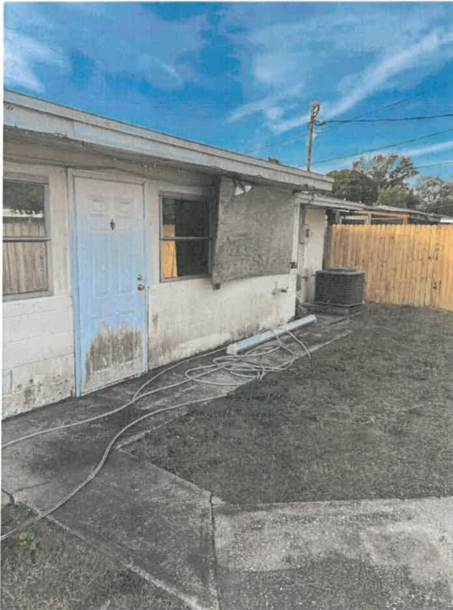
Picture 3: Back porch Broken window, open doors, trash. Picture taken on 1/22/26

jcrisp@kennethcityfl.org | www.kennethcityfl.org