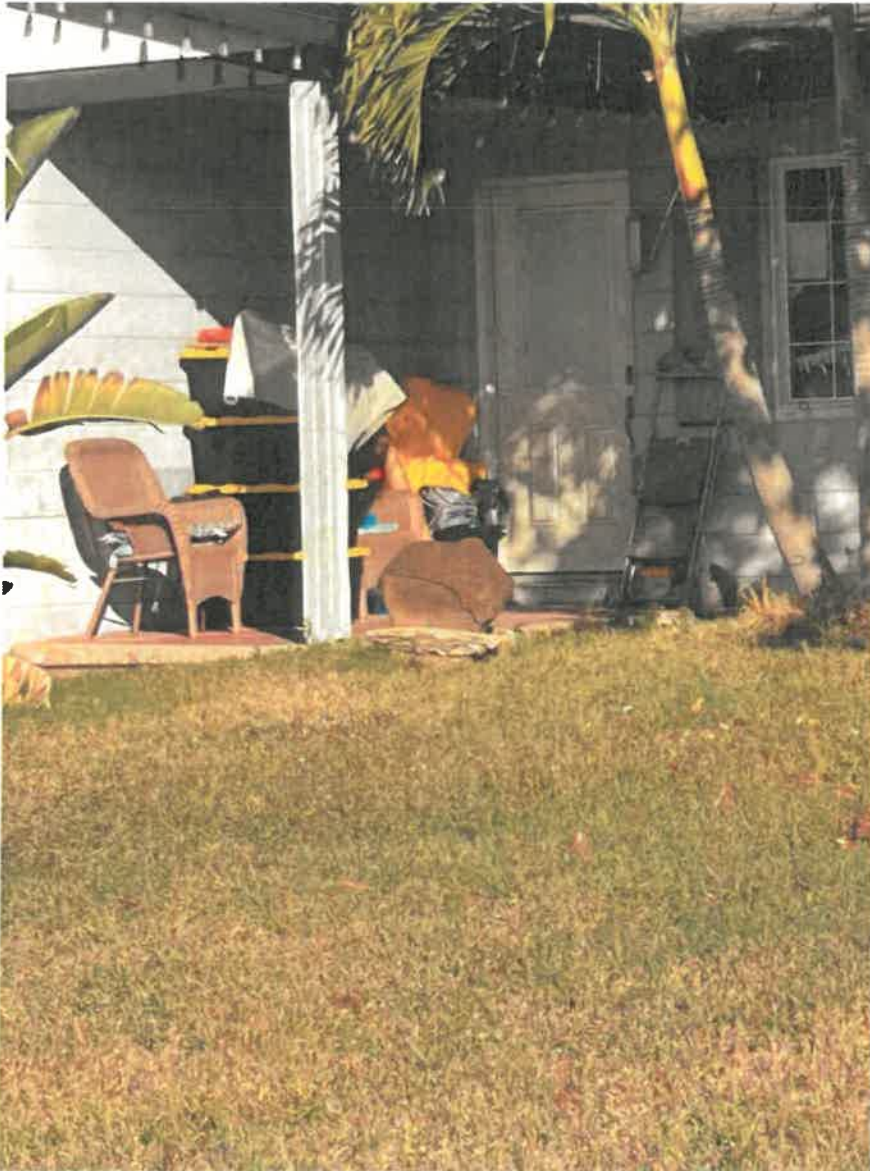
Photograph 1: Porch as it appeared on December 16, 2026

jcrisp@kennethcityfl.org | www.kennethcityfl.org