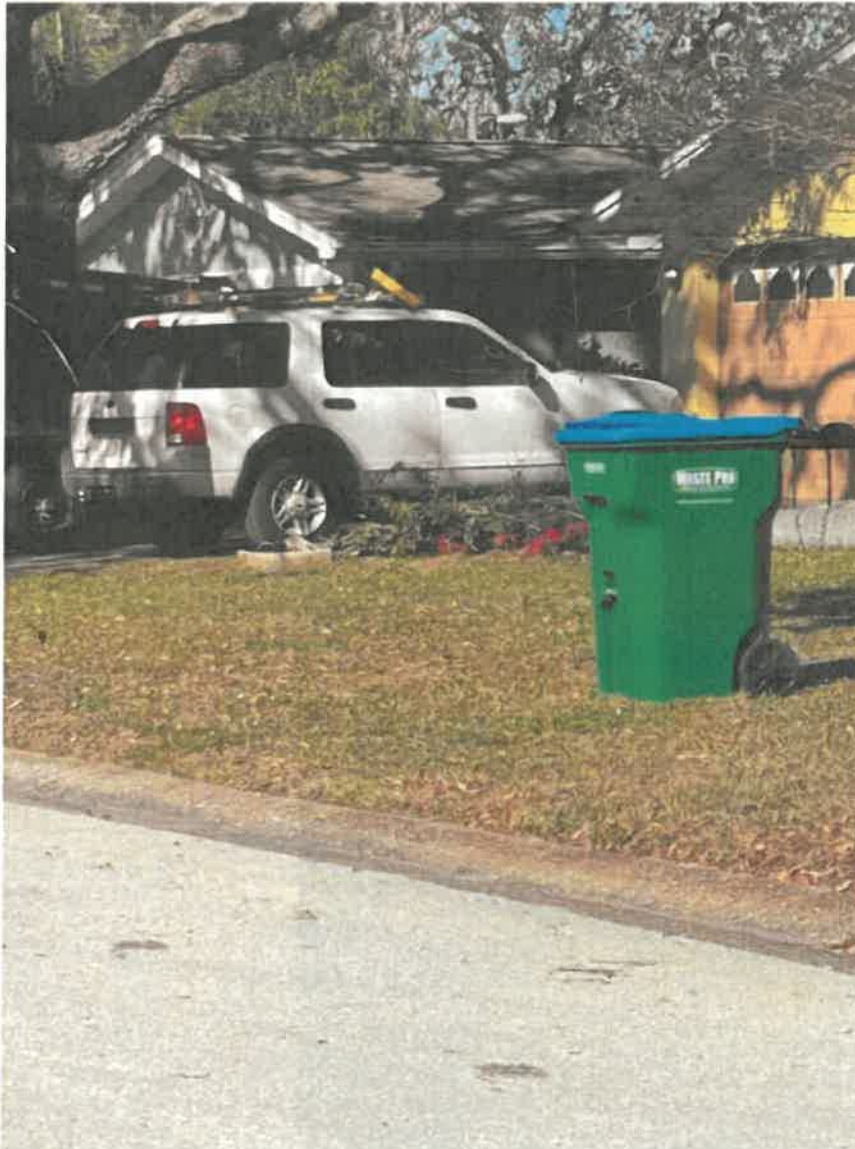
Picture 3: Tilted dump trailer behind SUV. Picture taken on 1/20/2026

jcrisp@kennethcityfl.org | www.kennethcityfl.org