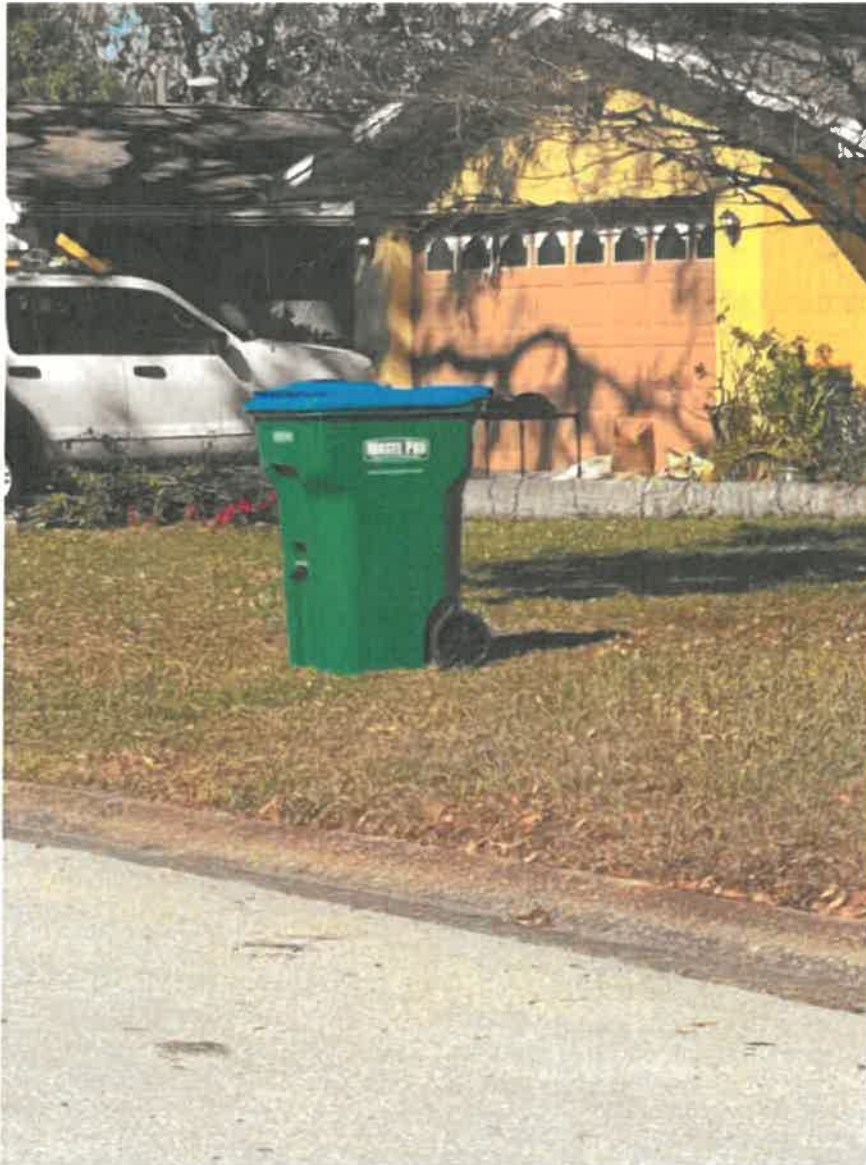
Picture 1: Fallen tree, Junk in front of garage tilt dump trailer behind SUV. Picture taken on 1/20/2026.

jcrisp@kennethcityfl.org | www.kennethcityfl.org