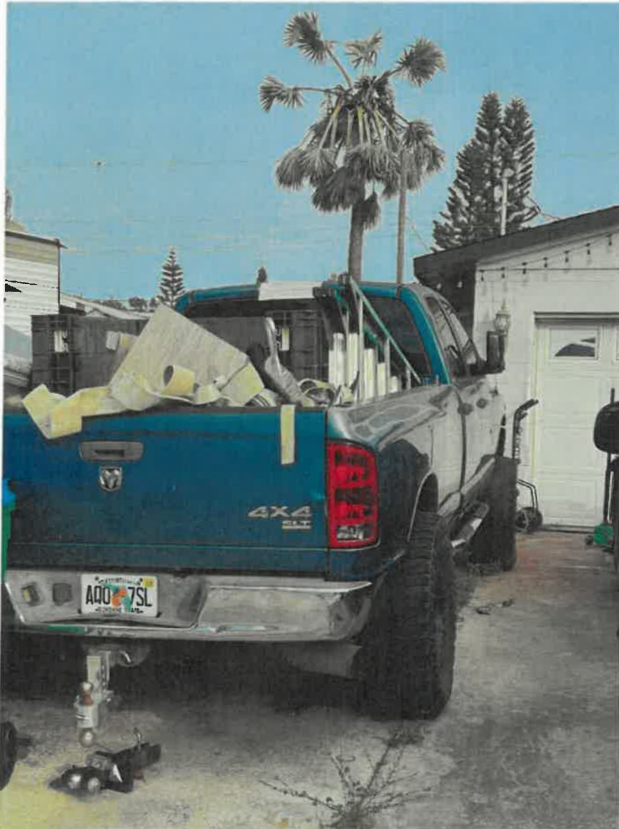
Photograph 4: Junk in back of truck as of December 16, 2026

jcrisp@kennethcityfl.org | www.kennethcityfl.org