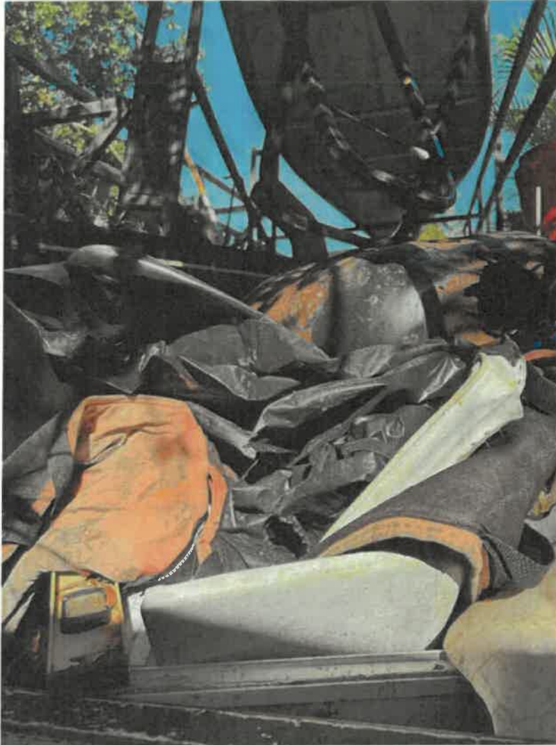
Picture 4: Castle residence. Junk in the back of work truck. 1/22/26

jcrisp@kennethcityfl.org | www.kennethcityfl.org