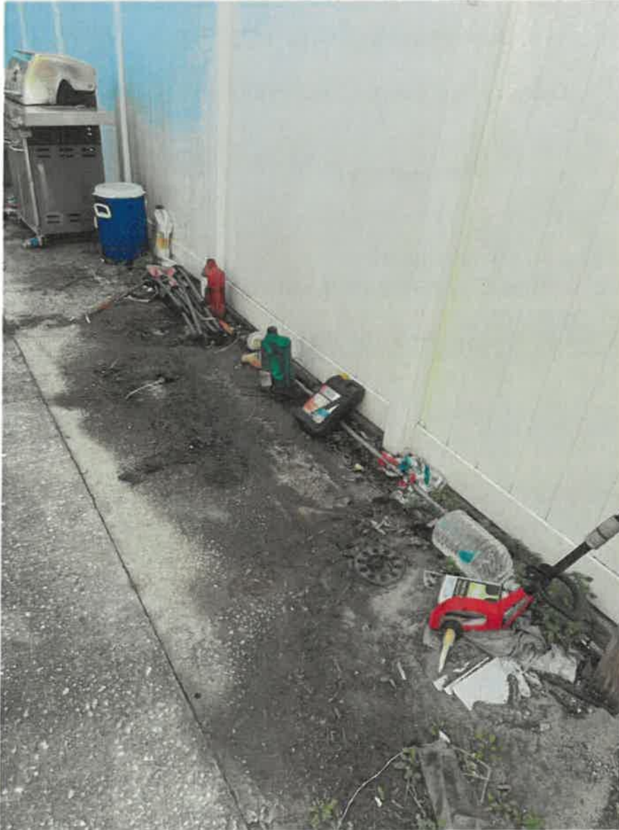
Picture 4: chemical bottles, grill and grease, lp gas container, trash, contaminants. Picture taken on 1/22/26.

jcrisp@kennethcityfl.org | www.kennethcityfl.org