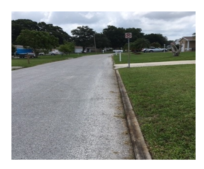
Example: Properly Maintained Curb Area by Adjacent Property Owner