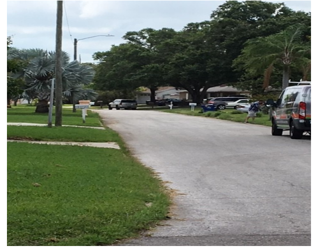
Example: Vegetation Overgrowth Beyond Curb (Not Permitted)

If a tree must be removed, please consult the Town's Building Department at (727) 498-8948 to see if a permit is required.