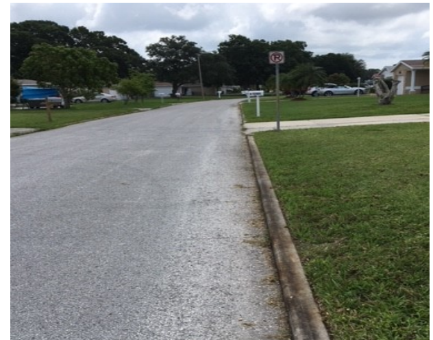
Example: Properly Maintained Curb Area by Adjacent Property Owner